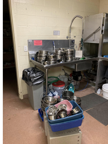
Get to work ladies! Grub is done.

Auxiliary Outreach at the Weber County Animal Shelter. Dishes and laundry always need our help. I love hanging out with these ladies and look forward to Wednesdays! I'm so grateful for ALL of the workers and volunteers, and the love and hard work they put into giving these animals a clean space, medical care, foster care, and furrever homes.