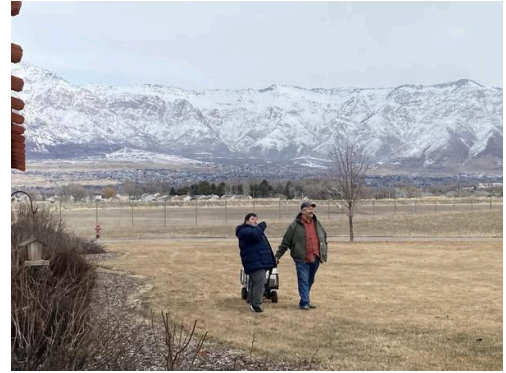
Boy Scout Troop 1481 braving the cold wind to fill bird feeders at the Vets Home.